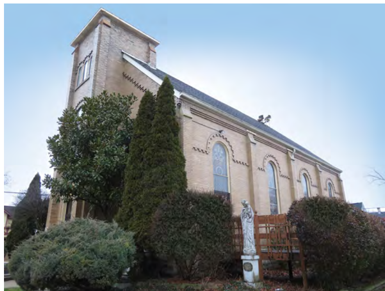
Church: 140 West Avenue