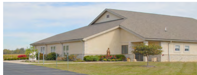
Parish Activity Center and Parish Office 670 W. Main St Plain City, OH 43064