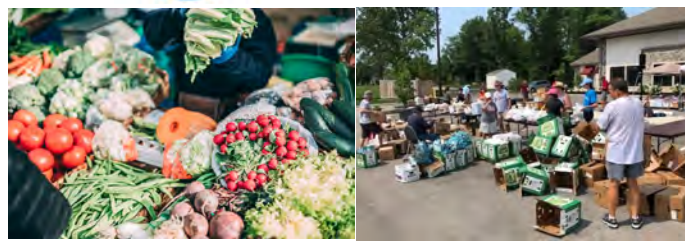
In partnership with Mid Ohio Foodbank

Our Lady of Lourdes 1033 W. 5th St., Marysville