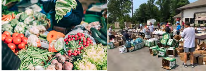
In partnership with Mid Ohio Foodbank

Our Lady of Lourdes 1033 W. 5th St., Marysville