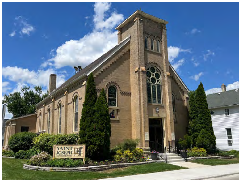
Church: 140 West Avenue