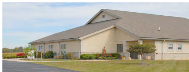
Parish Activity Center and Parish Office 670 W. Main St Plain City, OH 43064

CONFESSIONS: 3:30 pm Saturdays and by appointment