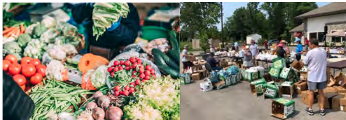
In partnership with Mid Ohio Foodbank

Our Lady of Lourdes 1033 W. 5th St., Marysville