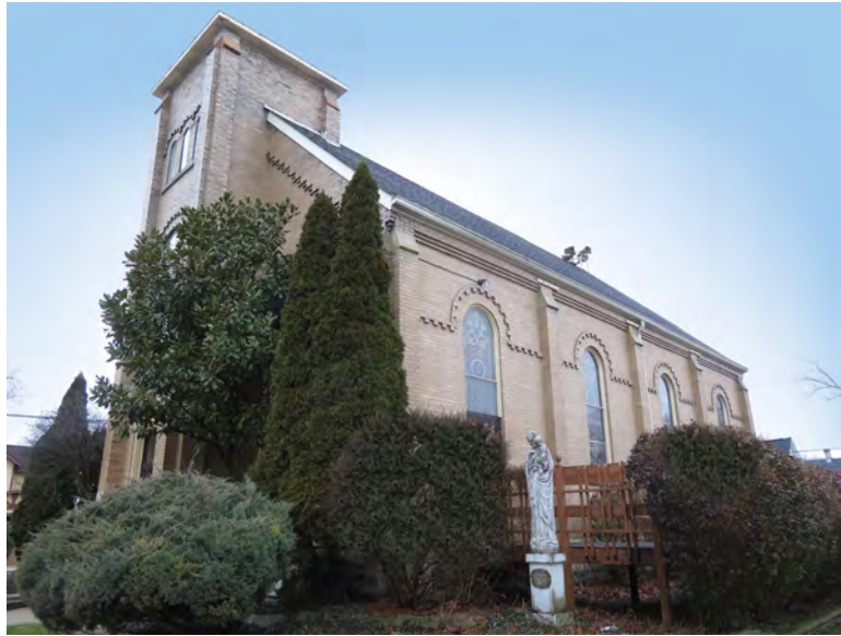
Church: 140 West Avenue