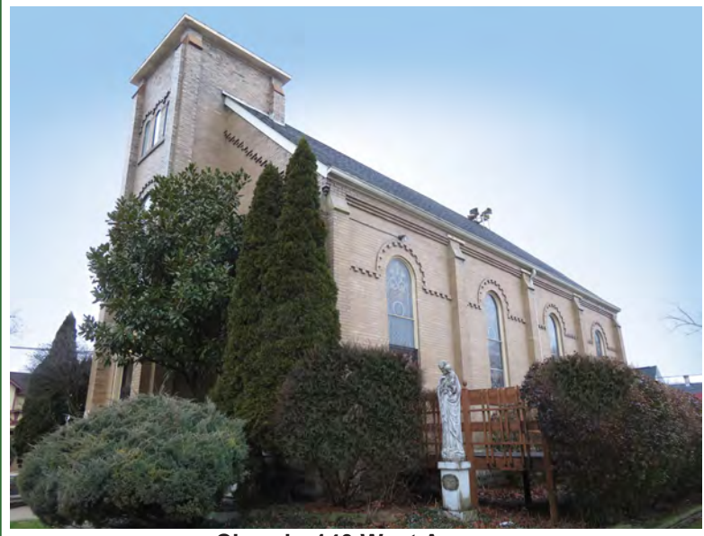
Church: 140 West Avenue